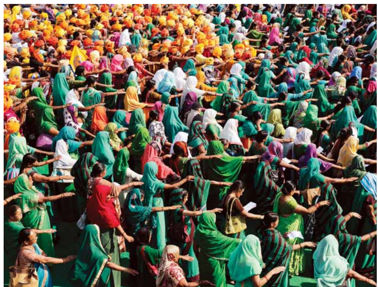
Officials and civilians take oath for a clean Ganga on the banks of the river in Allahabad on Sunday. A court in northern India had on Monday given the status of living entities to the Ganga and the Yamuna river to save them from further harm caused by widespread pollution