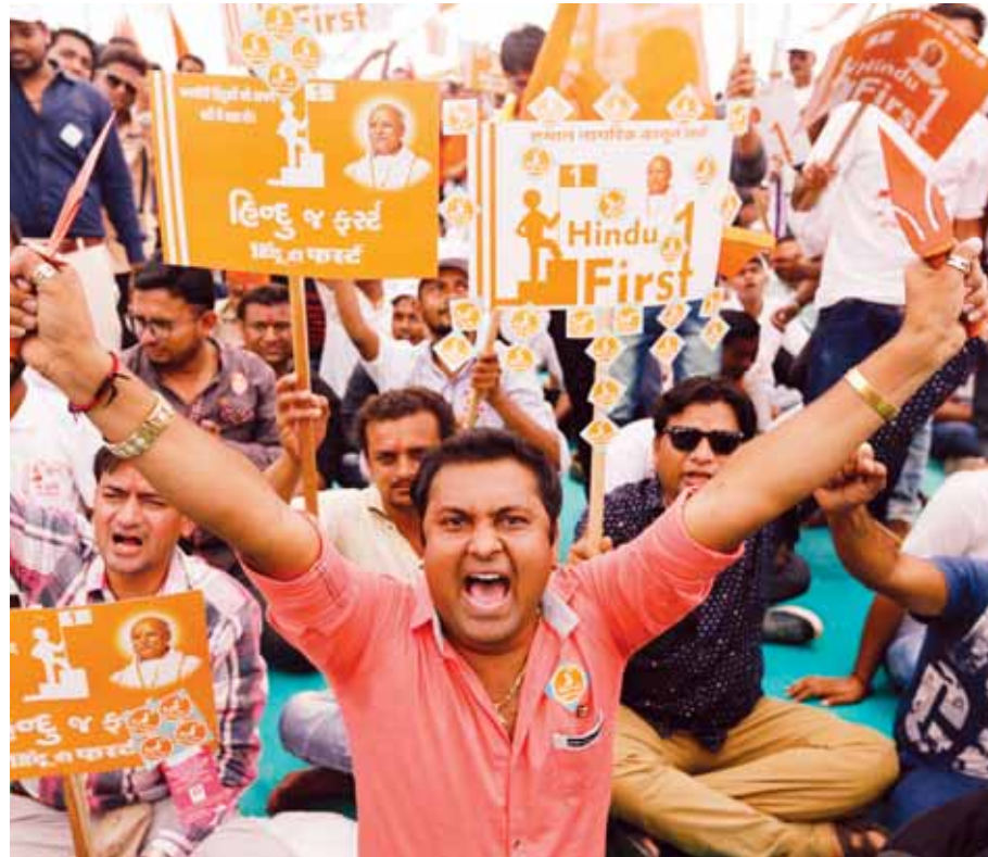
A man holds tridents and shouts slogans as he attends a Hindu convention organised by the Vishva Hindu Parishad in Ahmedabad

Cabinet has up from ₹1.48 crore in 2011 to ₹2.52 crore in 2016. The net worth of her wife's immovable property has jumped more than three times. Hakim is also seen the Narada video tapes apparently telling the sting journalist that ₹5 lakh is a small amount just enough only for his followers (Bacchhas). The resources (read assets) of State Water Resources Minister Soumen Mahapatra have increased to ₹1.97 crore whereas in 2011 it was just about ₹69.50 lakh. Similarly the assets of Paschimanchal Development