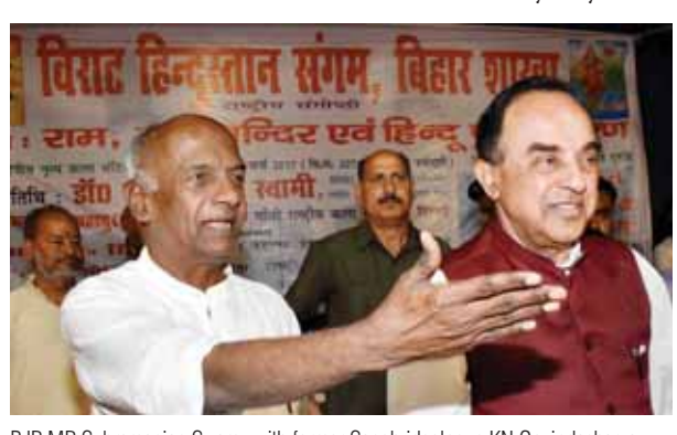
BJP MP Subramanian Swamy with former Sangh ideologue KN Govindacharya during inauguration of a lecture on 'Ram Mandir and Hindu Punarjagran' at Nrltya Kala Mandir in Patna on Sunday

■ PATNA Senior BJP leader Subramanian Swamy on Sunday praised former Prime Minister Rajiv Gandhi as the only good human being in the (Nehru-Gandhi) family and said he had contributed to awakening of the Hindus. "Rajiv (Gandhi) was the only good human being in the (Nehru-Gandhi) family and had contributed to awakening of the Hindus," he told reporters here. Swamy, a Rajya Sabha MP, recalled that the former Prime Minister had allowed telecast of popular mythological serial Ramayana on Doordarshan and later got the locks of Ram temple at Ayodhya opened for prayers. "Rajiv (Gandhi) allowed telecast of the mythological soap Ramayana on Doordarshan, the national tele