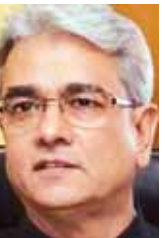
Comptroller and Auditor General of India Shashi Kant Sharma

CAG has audit jurisdiction over any body or authority which has any relation to Government revenues and expenditure and resistance by some like city development bodies, DISCOMs and metro corporations will wither away. We plan to audit certain issues related to fiscal impact of demonetisation, largely its impact on tax revenues